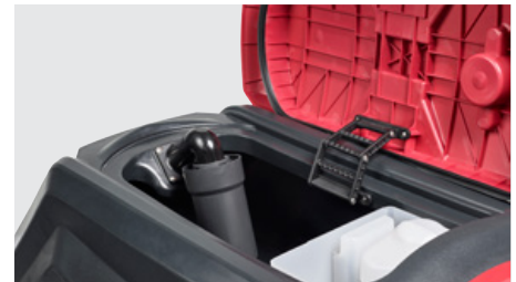
Large opening recovery tank and standard debris tray for quick and thorough clean up