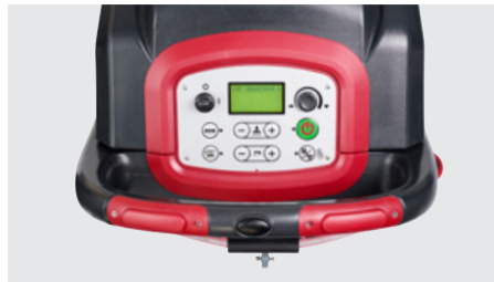
Intuitive control panel with LCD screen comes standard on all models (AS6690T/AS7690T shown)